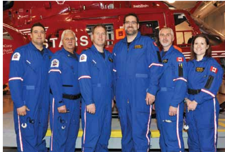
The pilots and air medical crew who flew the first STARS mission in Saskatchewan.